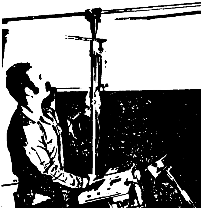
Fig. 2. Simulated uranium-holdup measurement.

Two major applications, which use external control, are now under development at Los Alamos. One development will soon be tested at the Oak Ridge Y-12 plant. This is a portable cart with a PMCA, a HX-20, and a complement of NaI detectors. It will be used to measure uranium holdup in high-enriched powder transfer lines. Figure 2 shows a technician placing one of the detectors over a simulated transfer pipe. The HX-20 controls data acquisition and analysis. Results are printed on the HX-20's internal printer. The use of this system is mainly for inventory and it may have limited use in process control.